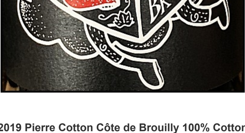
2019 Pierre Cotton Côte de Brouilly 100% Cotton (France, Burgundy, Beaujolais, Côte de Brouilly) $44

We've been waiting for this one! And it was worth it as Pierre Cotton has been on a roll these last 3 vintages; unstoppable really.