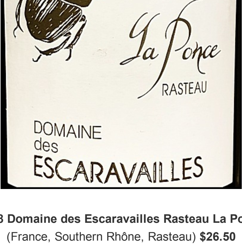
2018 Domaine des Escaravailles Rasteau La Ponce (France, Southern Rhône, Rasteau) $26.50

Everyone loves a sale, especially when it's one of our favorite wines. Sito Moresco combines the complexity of Nebbiolo with the roundness of Barbera and the body of Merlot. This is Super-Tuscan taken to the next level minus the Super-Tuscan price!