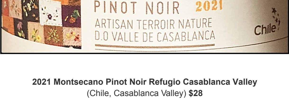
2021 Montsecano Pinot Noir Refugio Casablanca Valley (Chile, Casablanca Valley) $28

Motorcycle mechanic turned vigneron Pierre Cotton is a straight-up badass. We love his organic, unsulfured, and unfiltered 100% Cotton wine. Acid for days and tart fruit-forwardness. Serve chilled, pop at happy hour, and quickly become everyone's favorite host.